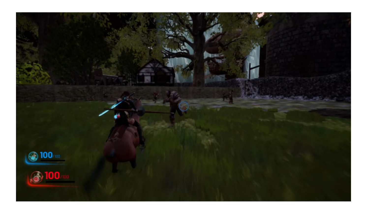
Wild Mage - Phantom Twilight Download For Pc [Crack Serial Key

Download >>> <a href="http://bit.ly/2JYgTt5">http://bit.ly/2JYgTt5</a>